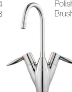
Exubera™ Contemporary Series Faucet Polished Stainless EV9008-30 Brushed Stainless EV9008-31